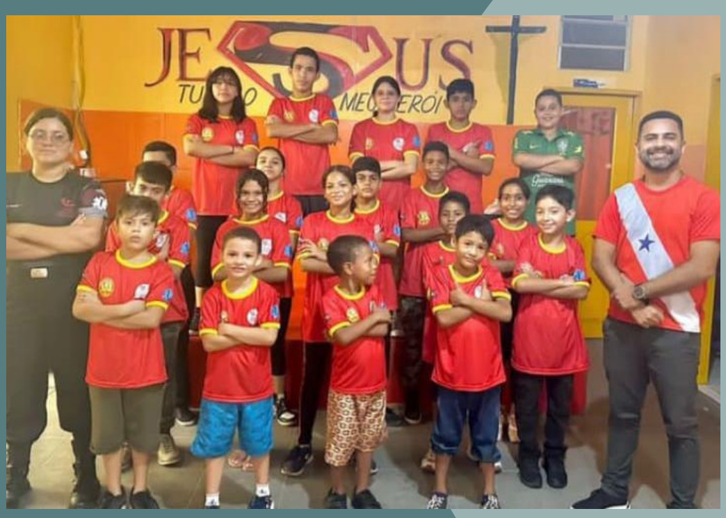
Junior Firefighter course team